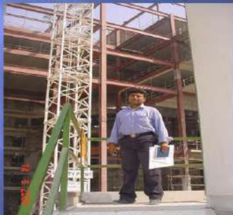
Emirates Crew Training College Garhoud